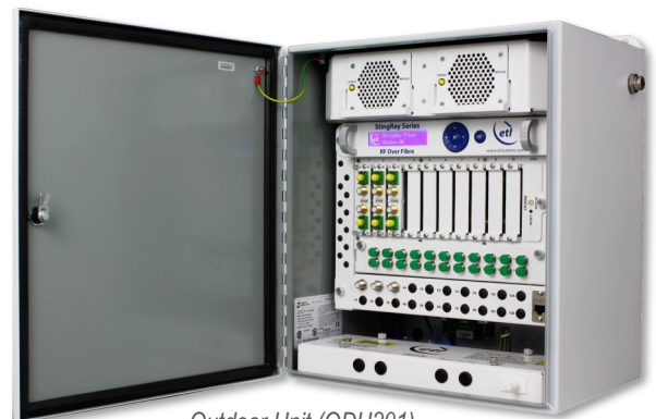
Outdoor Unit (ODU201)