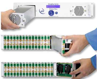
Indoor chassis showing hot-swap power supply modules, fibre modules and fans

10MHz Inject from an external source chassis option